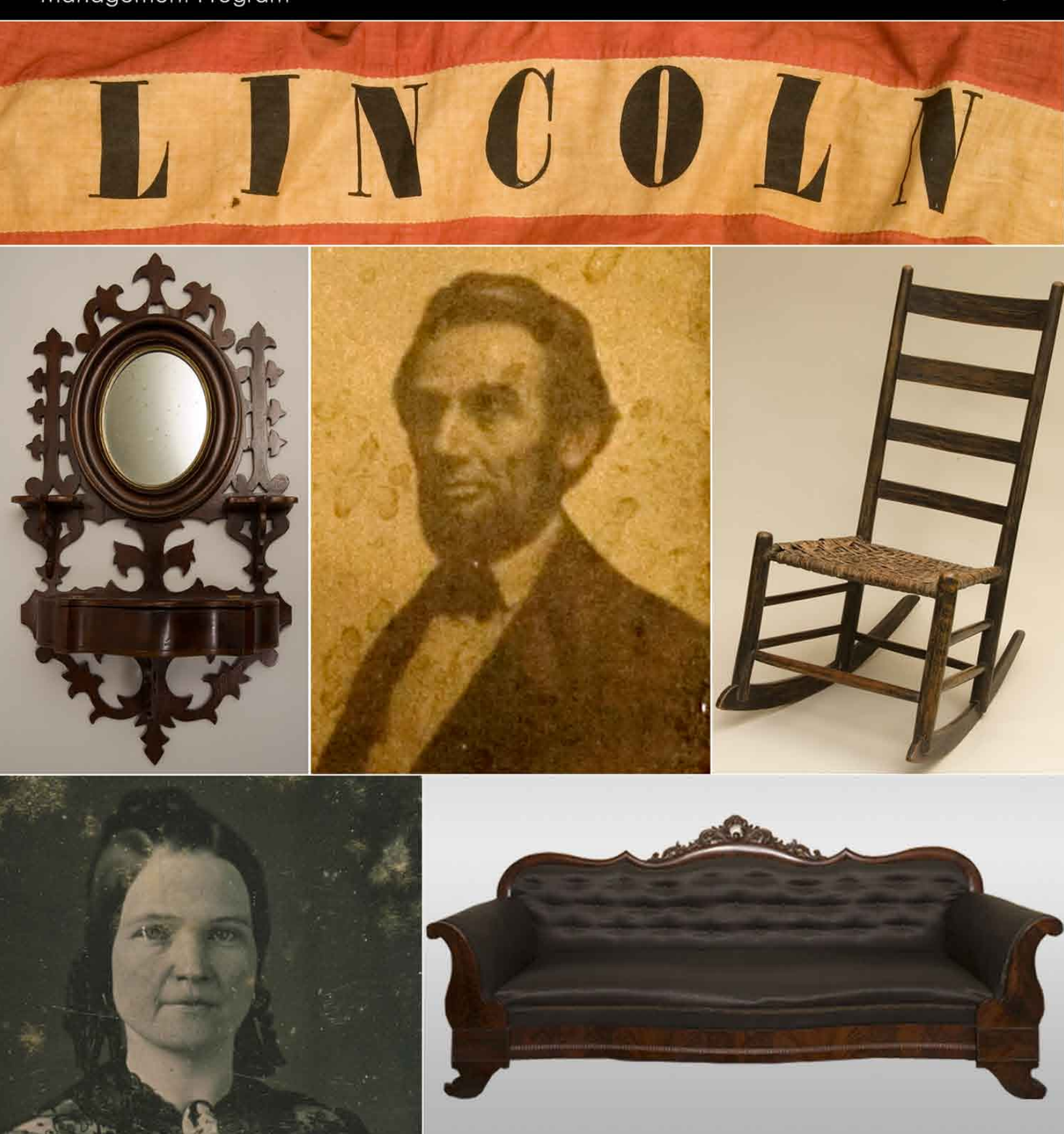
Teaching with Museum Collections Lincoln Home National Historic Site www.nps.gov/history/museum